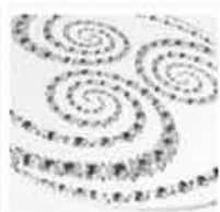
shimmering surfaces, celtic motifs

This exhibition provides a contemporary interpretation of all aspects of light, from the illumination of Newgrange at the winter solstice to various aspects of light in nature including the Whirlpool galaxy, water crystals and fractal designs. Each piece of art expresses beautiful, intricate patterns with simple elegance using natural silks and fine crystals to create entirely unique art forms.